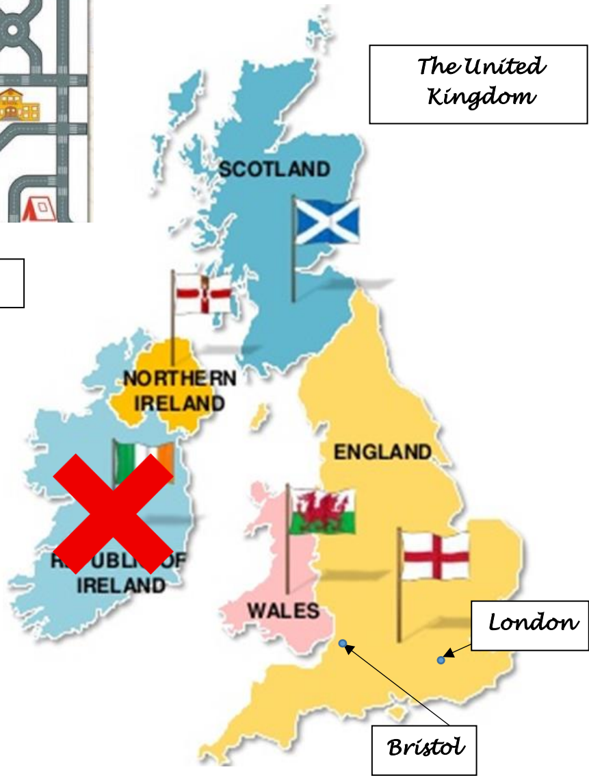
The United Kingdom