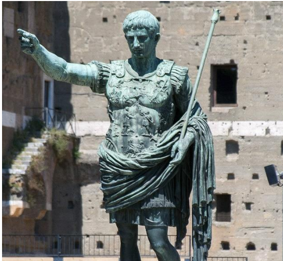
A statue of Julius Caesar