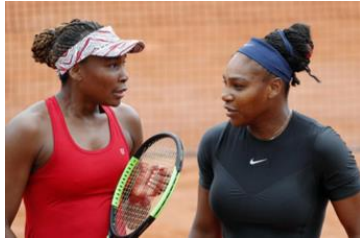
Serena and Venus Williams